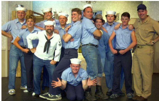
The sailors from "South Pacific"