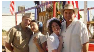
South Pacific Principals