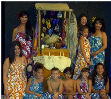
Children from “South Pacific”

Tickets for “South Pacific” are available now by calling the box office.