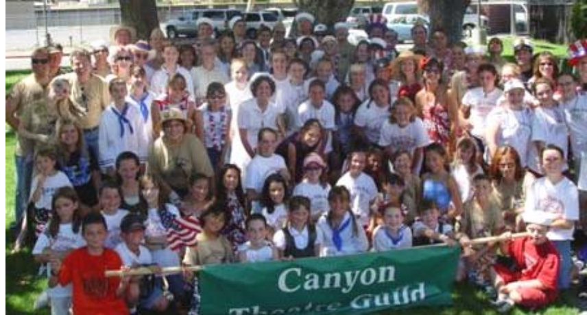
Canyon Theatre Guild Family at the Parade