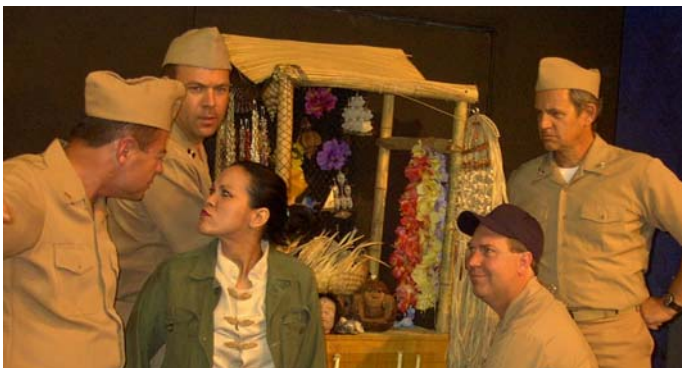
Bloody Mary and the men of "South Pacific"