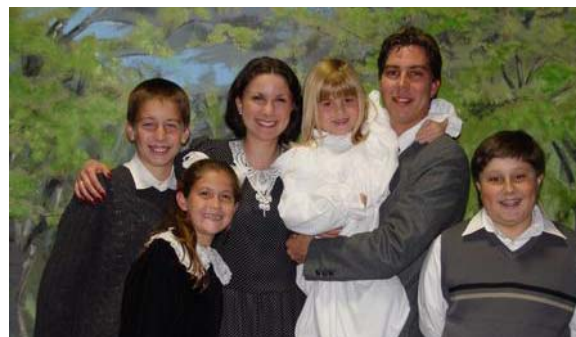
The Bailey Family