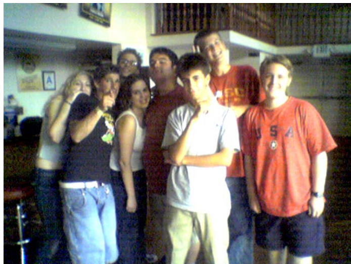
Crazy CTG Kids who participated in the Halloween show and the after-school workshop, "Music Man, Junior"