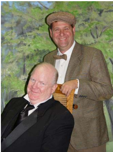
Henry Potter & Clarence Odbody