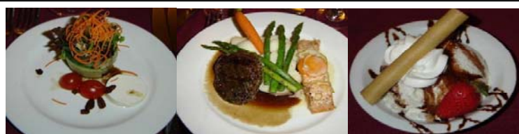
Dinner at the Gala

So, in closing, many thanks to all of you! If I have forgotten anyone, I sincerely apologize and hope you'll give me a chance to make up for it by volunteering again next year! Till then, BRAVO, and sincerely, thank you!