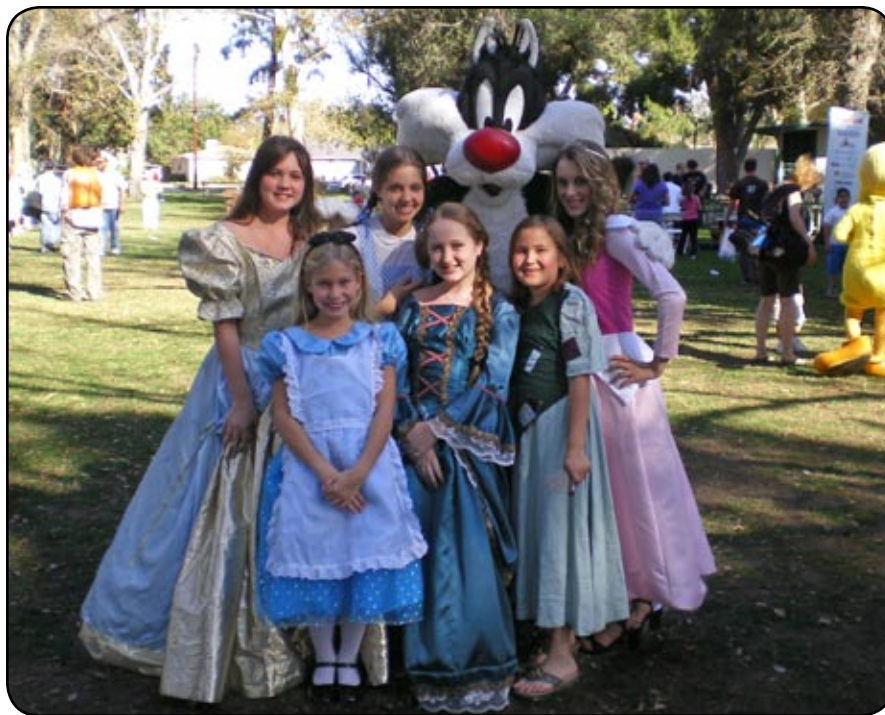
Children’s Art & Literacy Fair on November 3