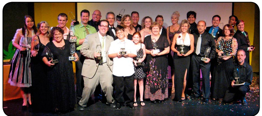
Goldie Winners from 2007-2008 Season