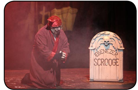
Scrooge at his headstone in A Christmas Carol

creating models for special effects in the movie industry (many of his works have exploded in front of your eyes!) to doing family counseling, and lecturing. He helps youth throughout Southern California by presenting science shows about dinosaurs, volcanos, and astronomy. He gets them involved by having them dig for dinosaur bones and making a model of a volcano actually erupt! Occasionally you’ll see him at Vasquez Rocks with the SCV “Local Group”