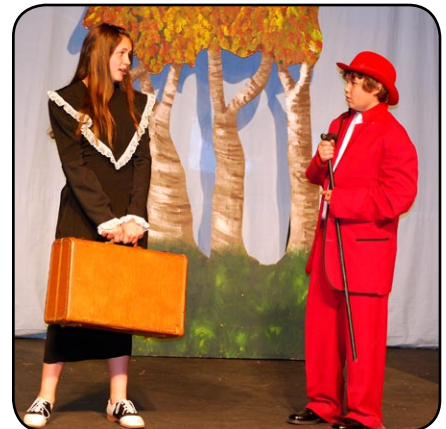
A scene from last semester's ACT IV Workshop

It's going to be another exciting year and we're looking forward to meeting the new students and welcoming