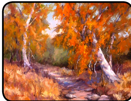
Sycamores in December Oil on Linen by Laura Wambsgans

In the morning quiet of these parks all you hear are clutches of quail taking off in unison as you approach; the rustle of deer’s hooves in the brush as they graze under the oaks; and hawks calling, seemingly out of pure joy. Cool air bounces off the rock walls, from the night before.